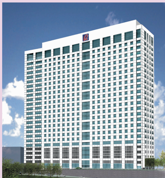
Robinsons Cybergate 3

Just like its predecessors, Robinsons Cybergate Center Tower 3 was designed to cater specifically to all kinds of Business Process Outsourcing service providers, including voice based, non-voice based, and IT-intensive companies. Located at the eastern end of the mixed-use Robinsons Pioneer complex in Mandaluyong City, it is easily accessible via private and public transportation. Completed in mid-2008, this project is a 27-storey, BPO-friendly designed office building with a gross leasable area of approximately 40,000 square meters.