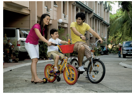
The Centennial Place