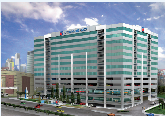
Robinsons Cybergate Plaza

Robinsons Cybergate Plaza is one of the most awaited additions to RLC's Robinsons Pioneer mixed-use complex. Comprised of six office floors, two budget hotel floors, and two commercial/retail floors, Cybergate Plaza is truly a one-stop location for corporate professionals and businessmen.