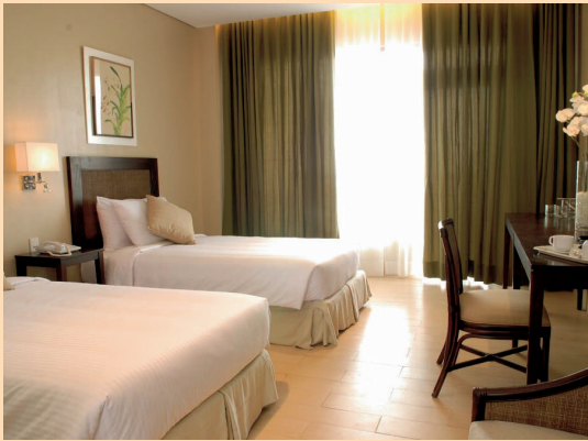
Summit Ridge Hotel

Located at KM 58 Maharlika West, General Aguinaldo Highway, Tagaytay City, approximately 3 kms from the Tagaytay Rotonda, the Summit Ridge Hotel showcases the important attributes of Modern Asian style of interior design which is a traditional look with the convenience and technology of the present times. This 108-room Hotel with facilities such as Ballrooms, Function and Training Rooms, Events Lawn, a view deck, Auditorium,