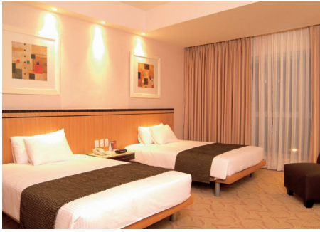
Crowne Plaza Galleria Manila