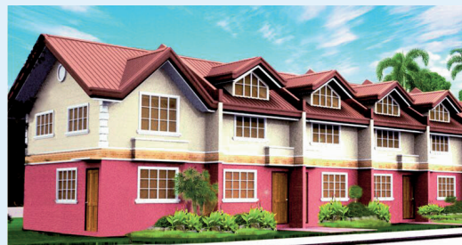
St. Bernice Estates

St. Bernice Estates is a 3.5-hectare expansion development of San Jose Estates, along the Antipolo-Teresa Highway in Brgy. San Jose, Antipolo City. The place is only an hour drive from the Ortigas Central Business District, making it easy for residents to go to work or visit their favorite shopping malls like Robinsons Galleria.