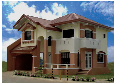
Robinsons Hillsborough Pointe