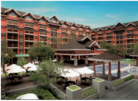
The Wellington Courtyard