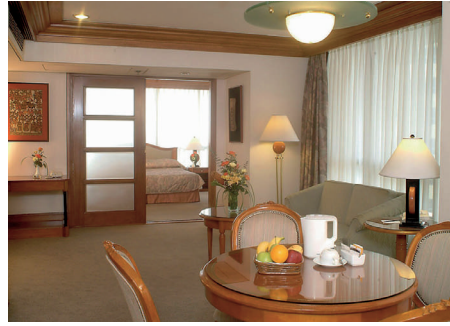
Holiday Inn Galleria Manila