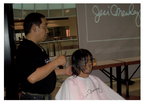
Livelihood seminar on small-scale businesses