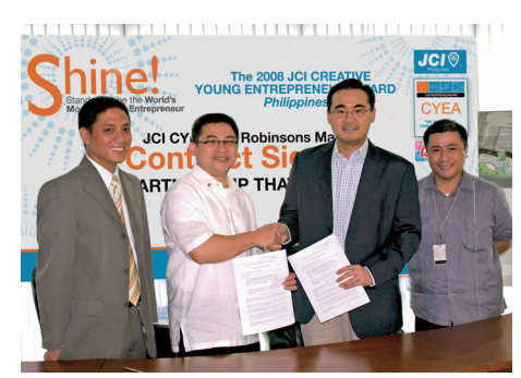
2008 JCI Creative Young Entrepreneur Award