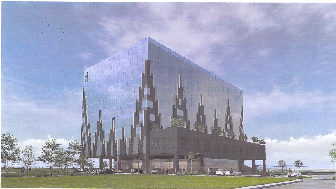
Artist's perspective of the upcoming Robinsons Offices development along JP Laurel Street in Davao City.

This newest development will further strengthen RLC's growing portfolio in Mindanao, which currently includes 8 shopping malls, 3 GoHotels properties, 1 Grand Summit Hotel, and 2 office buildings in the region.